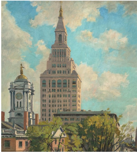
Of Hartford in Many Lights Celebrating Hartford's Buildings