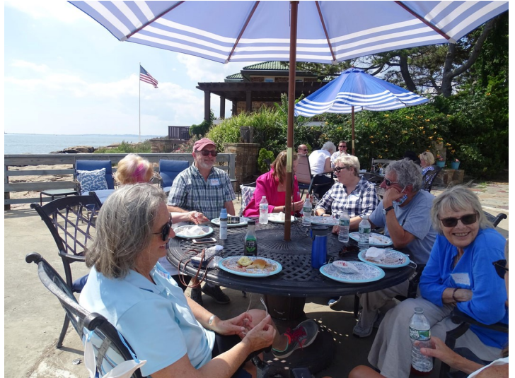
A Beautiful Day for the CPS Picnic

Our popular POP series will continue to be in a ZOOM format this fall. The Zoom links will be available soon.